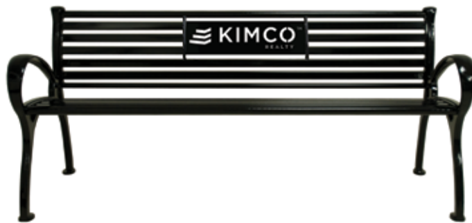
SC26 Schenley Bench with Back 6' with Laser Cut

SCHENLEY BENCH WITH BACK WITH LASER CUT Bench with back is covered by Patent No. Des. D629,233.