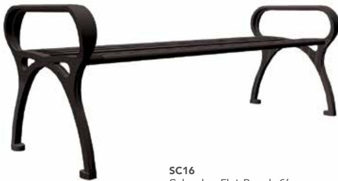
SC16 Schenley Flat Bench 6'