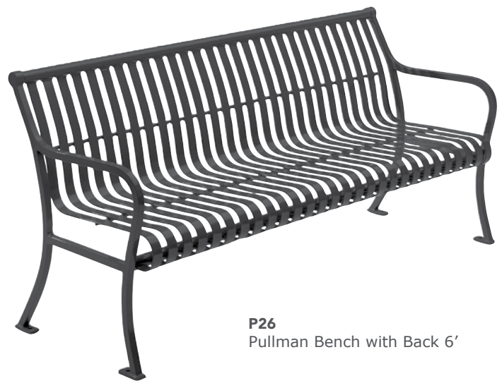
P26 Pullman Bench with Back 6'