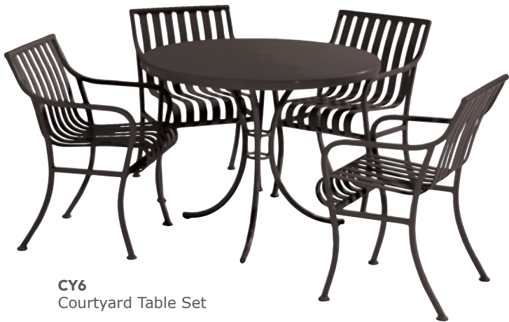
CY6 Courtyard Table Set