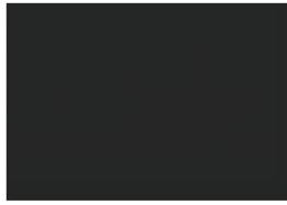
MATTE BLACK • 38/80020